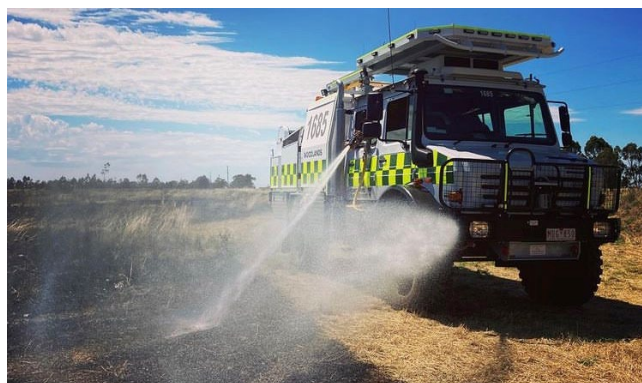
Planned burn in a western Melbourne park

Or call the VicEmergency Hotline on freecall 1800 226 226 or download the Vic Emergency app to see the location of ignited burns.