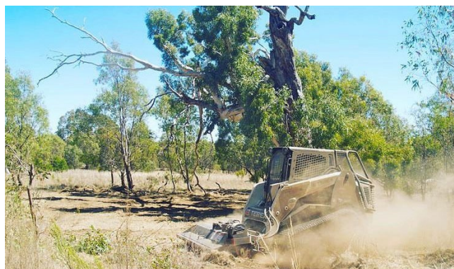
Mulching in Woodlands Historic Park to protect Red River Gums

We will be mulching a 5.4 hectare block along the west side of Gellibrand Hill this season, to help reduce fire risk and to control woody weedy species.