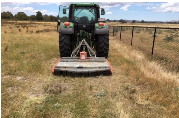
Grass slashing a fuel break in a grassland reserve

For information on the location of bushfire risk reduction activities, visit www.ffm.vic.gov.au/ifmp .