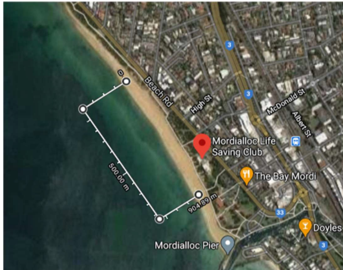
Mordialloc Surf Living Saving Club - 09.05.21 – 8.30am-4.00pm